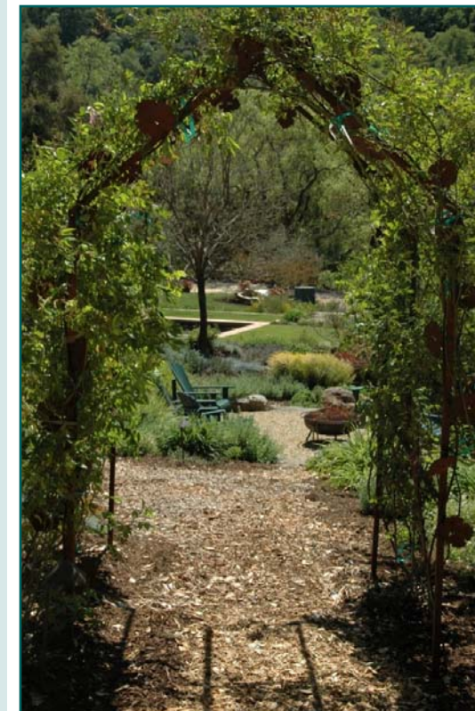
Garden Tour 2008

Once again the Garden Tour Committee has put together a fabulous garden tour for 2010. We have six unique gardens all within the Windsor area. Invitations have been mailed and we hope that you will join us for this delightful weekend touring homes and gardens. Please save the date and bring your friends.