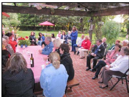
Garden Tour dinner guests listen as raffle tickets are drawn.