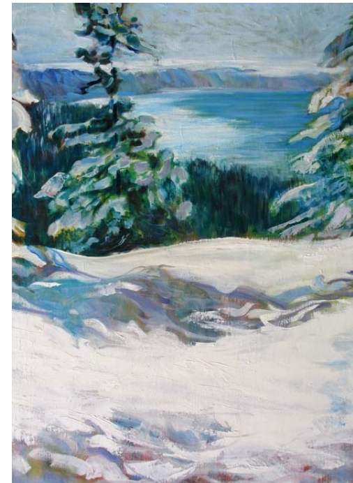
2009 Holiday Card image, "View from Incline," by Louisa King Fraser

The holiday season is one often touched by the remarkable. Such is the case with the 2009 Holiday Greeting Card project benefiting the Health Careers Scholarship Program as noted in the following: