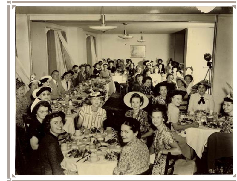
Alliance State Board Meeting 1950